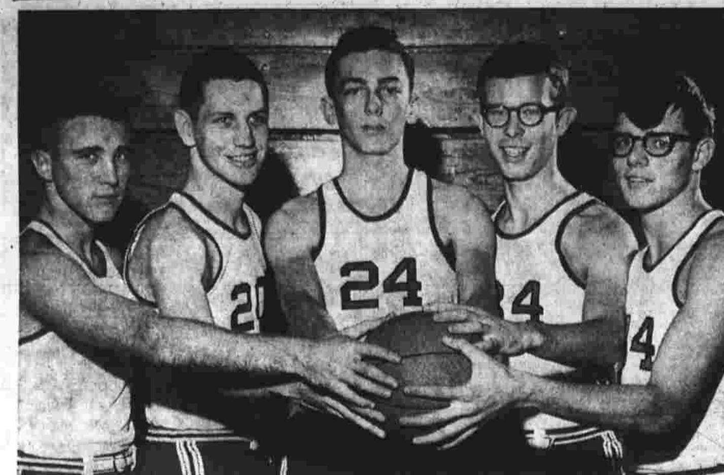
All-New Manchester Varsity Debuts Tonight at West Hartford