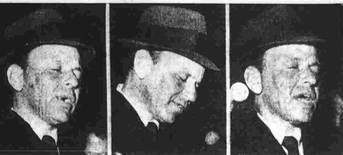
Frank Sinatra shows fatigue from three sleepless nights as he announces son's safety.

WASHINGTON (AP)—The Treasury expressed its concern today over the coin shortage which has become steadily worse during the Christmas shopping rush.