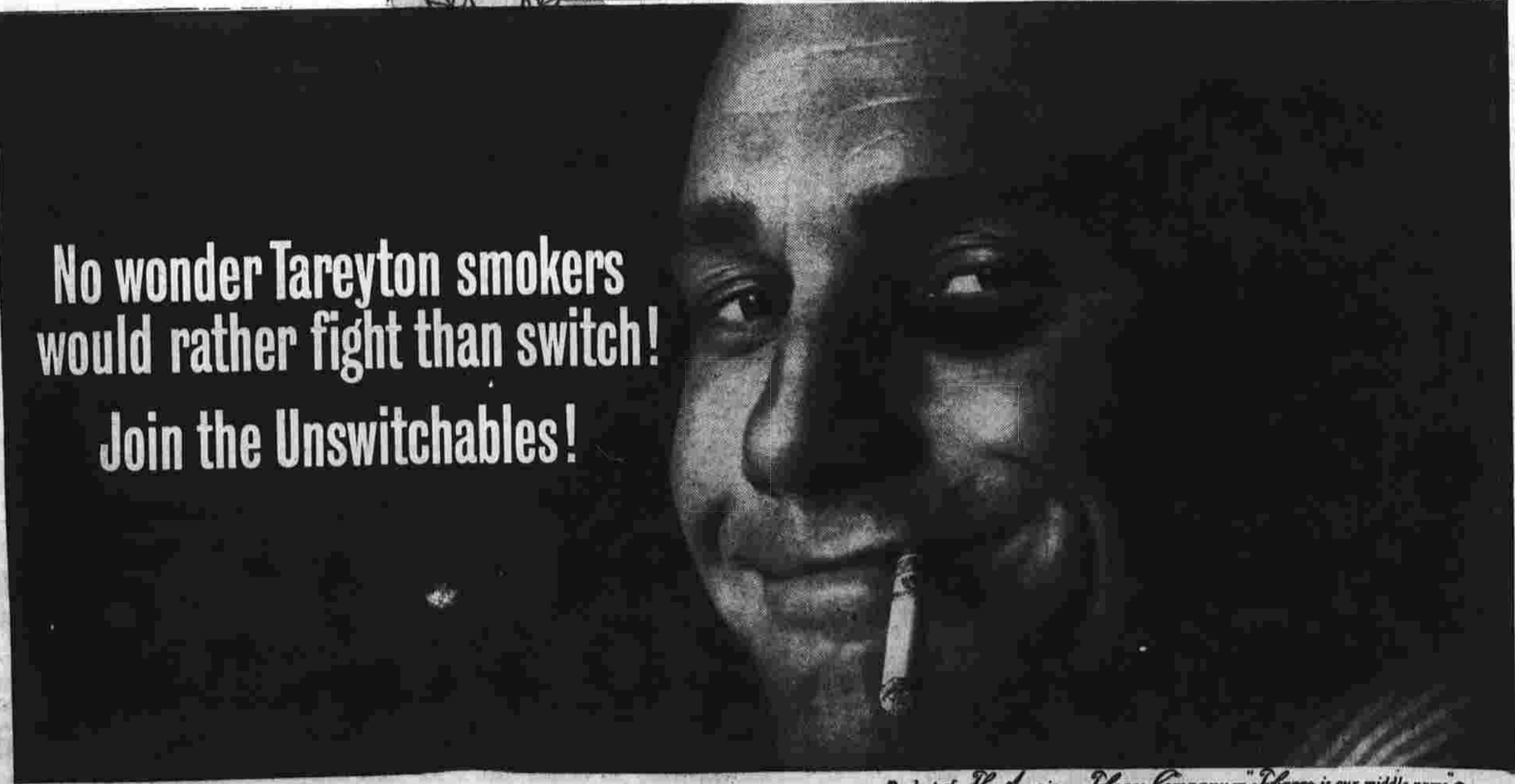
Product of The American Tobacco Company—Tobacco is our middle name

No wonder Tareyton smokers would rather fight than switch! Join the Unswitchables!